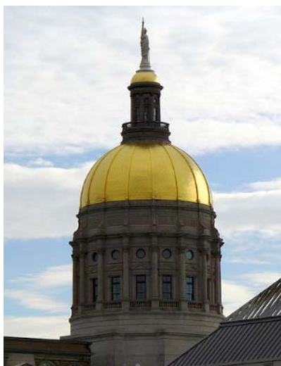
Debate rages on underneath the dome

Ads by Google New Moon Gift Boxing Gym Boxing Classes Boxing Aerobic